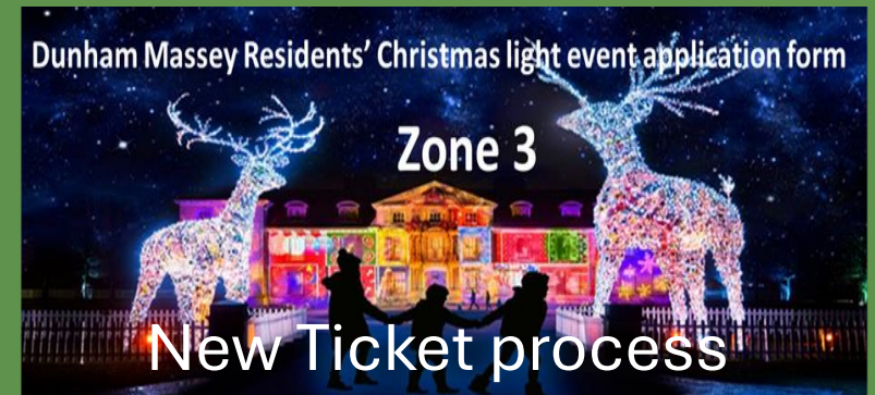
New Ticket process