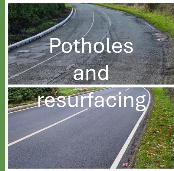
Potholes and resurfacing