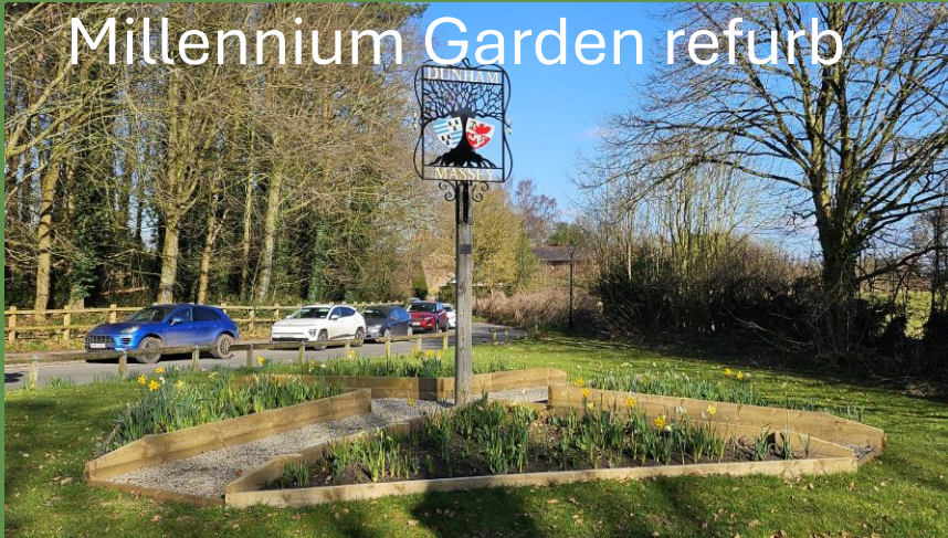
Millennium Garden refurb