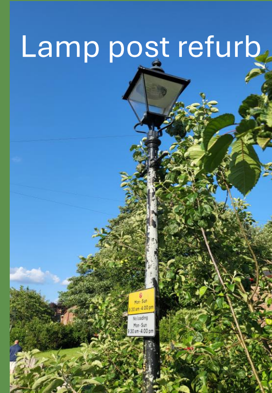
Lamp post refurb