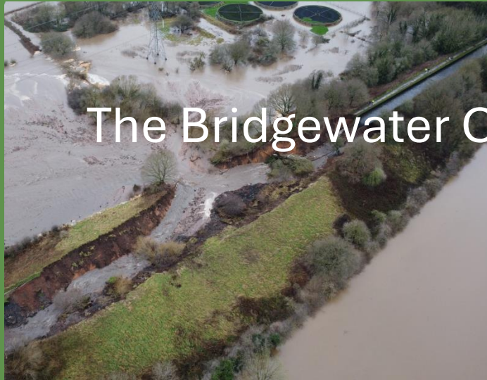
The Bridgewater Canal breach